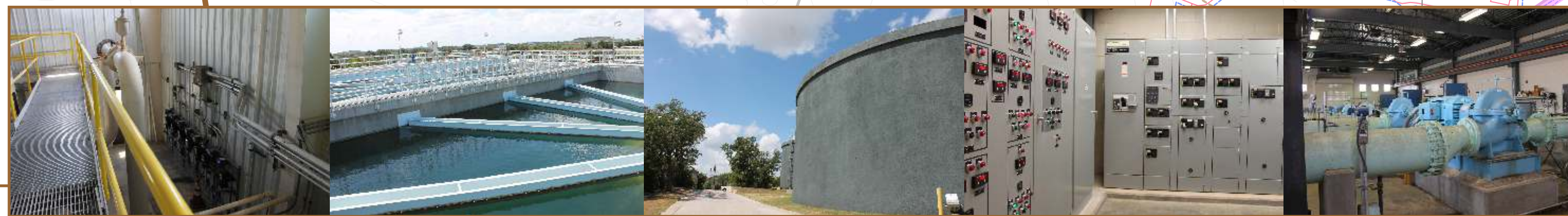
West Travis County Regional Water Treatment Facility